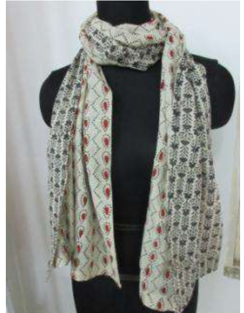
REVERSIBLE COTTON VOILE STOLES