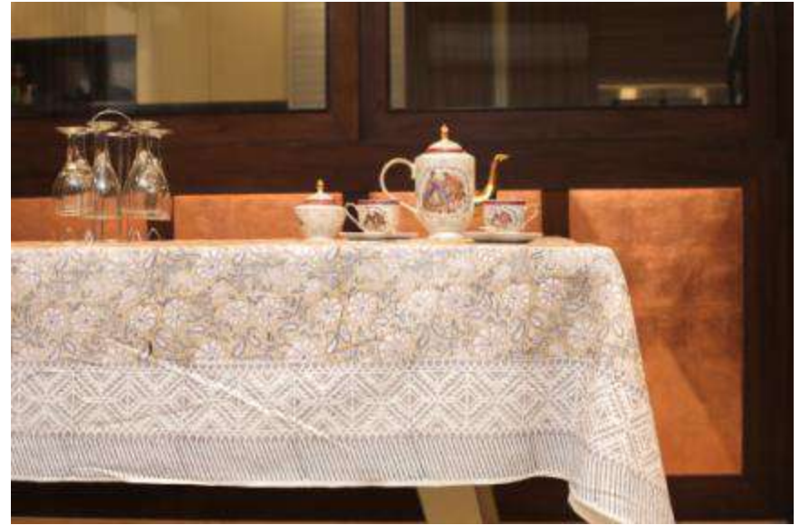
BLOCK PRINTS_TABLE LINEN